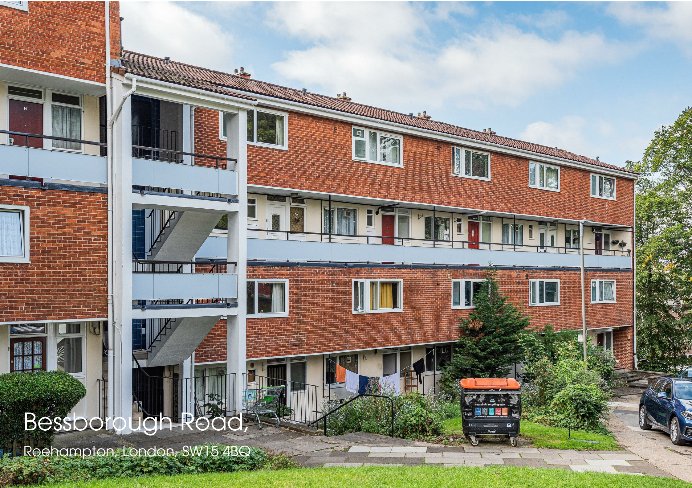
Bessborough Road, Roehampton, London, SW15 4BQ